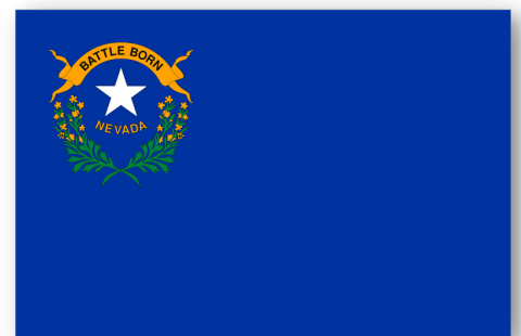
Nevada State Flag